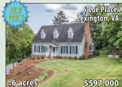
6 Coe Place. Lexington, VA