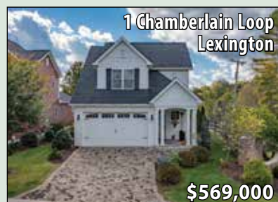
1 Chamberlain Loop Lexington