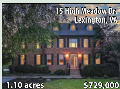
15 High Meadow Dr. Lexington, VA