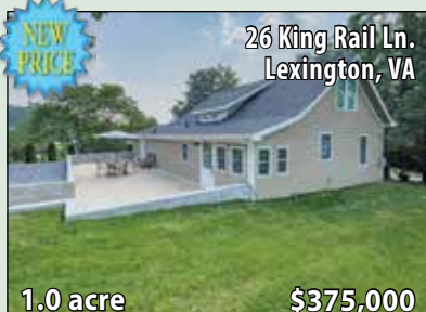
26 King Rail Ln. Lexington, VA