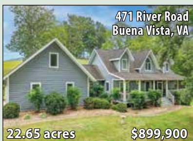
471 River Road Buena Vista, VA