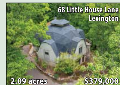
68 Little House Lane Lexington